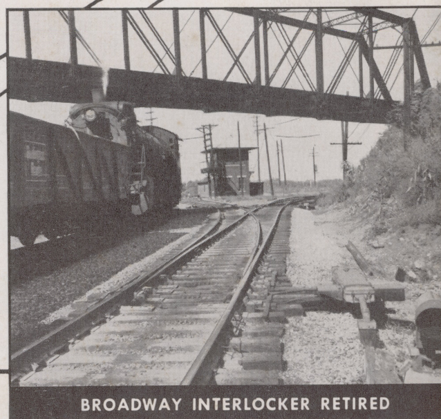
BROADWAY INTERLOCKER RETIRED